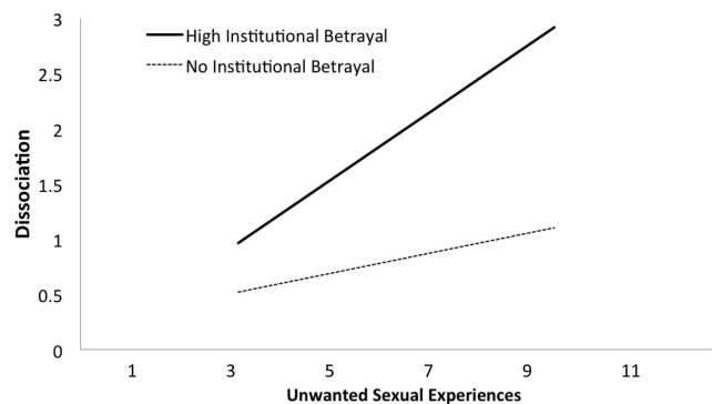
Figure 1 Exacerbative Effect of Institutional Betrayal

Institutional betrayal may contribute to the range of deleterious health effects associated with interpersonal trauma through incomplete access to health care services. Campbell (2006) found that women who were treated poorly during an emergency room visit following a sexual assault (e.g., asked victim-blaming questions, treated impersonally by staff) also tended to receive emergency contraceptives and sexually transmitted infection (STI) prophylaxis at lower rates than women who were treated respectfully. This mistreatment was also associated with seeking less follow-up care as well as with increased psychological distress.